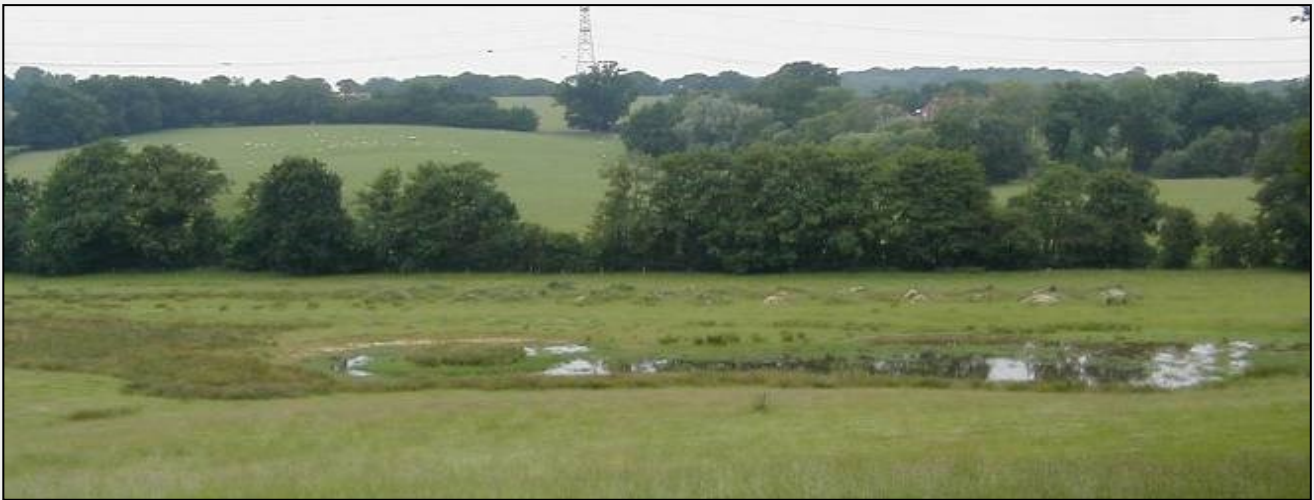
A wader scrape – a shallow depression providing refuge for wetland wildlife

Scrapes are shallow ponds of less than 1m depth which hold rain or flood water seasonally and which remain damp for much of the year. They are shallow depressions with gently sloping edges which create obvious water features in fields. They can make a significant difference to wildlife and can be created in areas of damp or floodplain grassland, arable reversion or set aside land. A wader scrape on your land can provide invaluable food and refuges for a wide range of wetland wildlife.