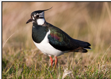
Wetland birds such as Snipe and Lapwing benefit hugely from wader scrapes